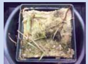
15 days after treatment

For optimal control, a second application may be needed 14 to 20 days after initial treatment.