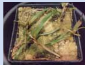
10 days after treatment