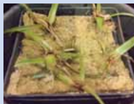
5 days after treatment

The doveweed images to the right demonstrate the type of dramatic results you can expect just days after a single treatment with Blindsight.